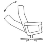
Manual Effortless Recline